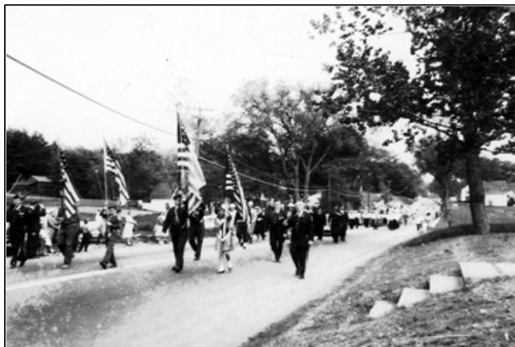
Photo: 1963 Memorial Day Parade approaching the Public Library.