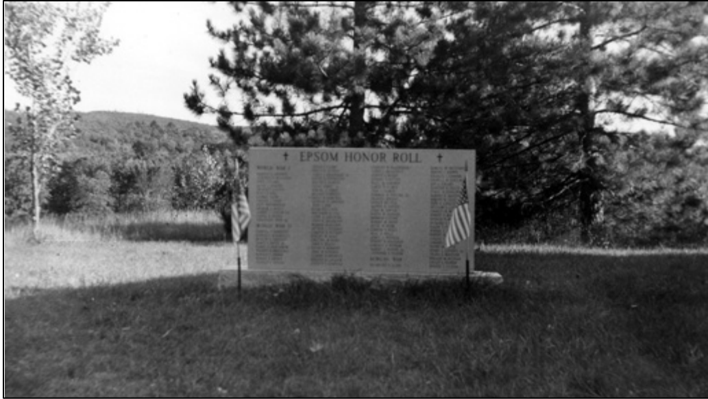
Photo: Close-up of the Epsom Honor Roll.