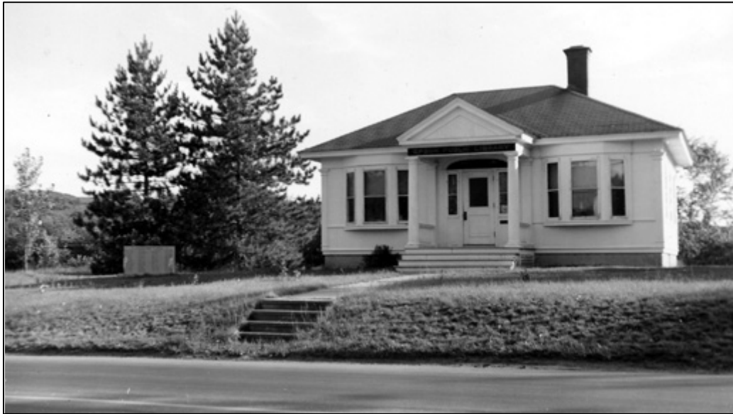
Photo: The old Epsom Public Library with the Honor Roll to the left.